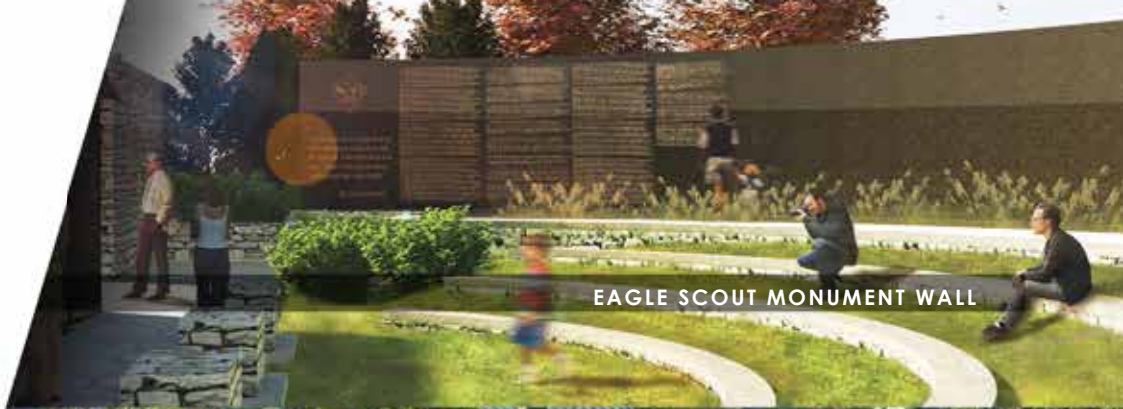
EAGLE SCOUT MONUMENT WALL