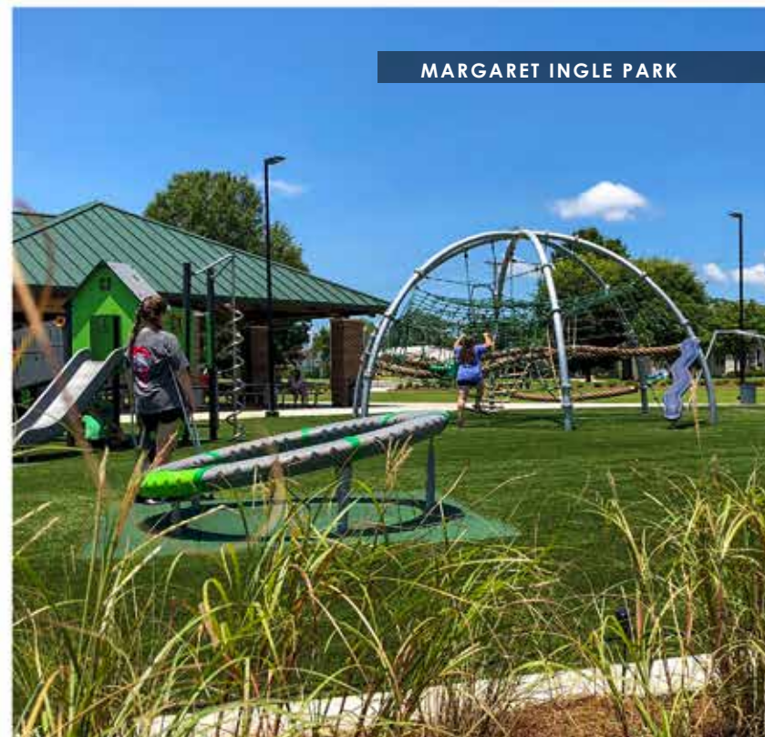
MARGARET INGLE PARK