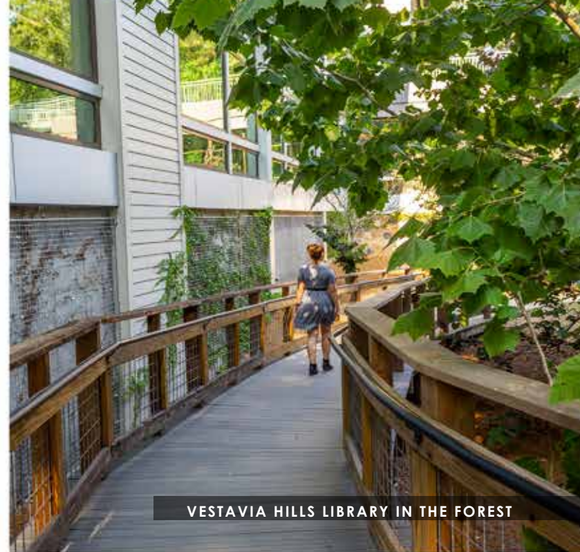
VESTAVIA HILLS LIBRARY IN THE FOREST