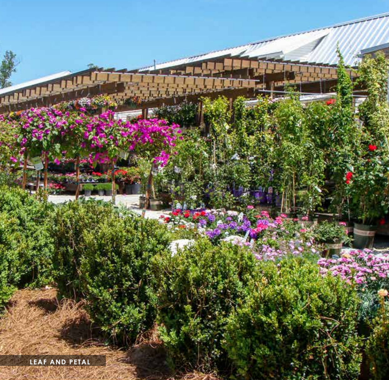
LEAF AND PETAL